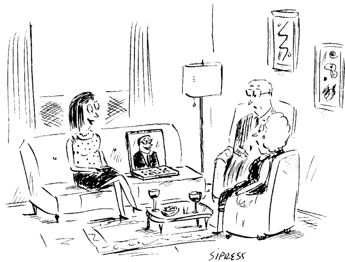
Cartoon 2.2: "We met online." © David Sipress / Condé Nast

both the utopian hope for new relational opportunities and the wary uncertainty that surrounds them.