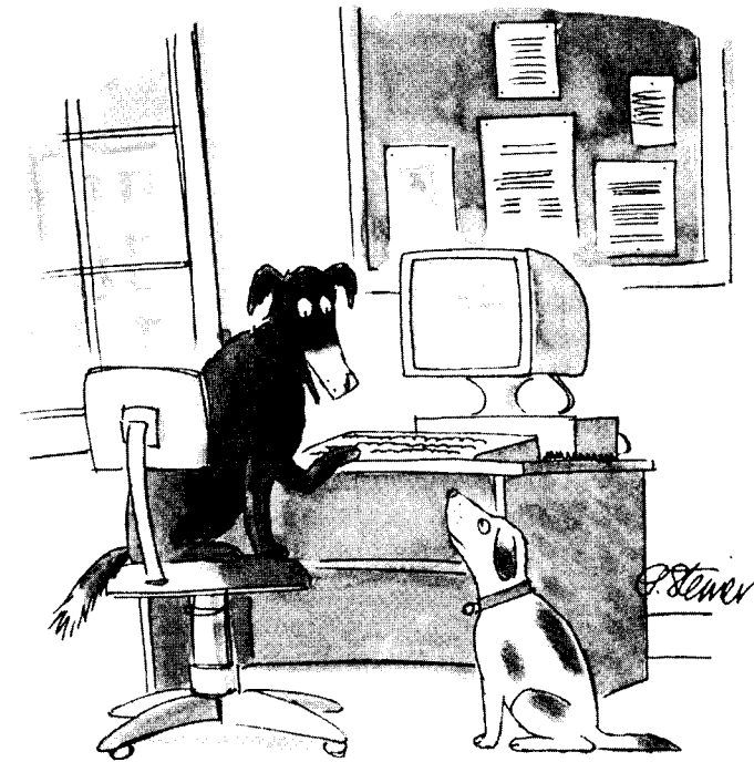
Cartoon 2.3: "On the Internet, nobody knows you're a dog." © Peter Steiner / Condé Nast

One reason for uncertainty in mediated environments is that, without visual and auditory social cues, people are not sure whether or not they can trust other people to be who they claim to be. This is the central problem of anonymity. Perhaps the best encapsulation of the binary between hope and dread that the anonymity of the internet provides is Peter Steiner's famous 1993 New Yorker cartoon of two dogs, one seated on a chair at the computer, the other sitting on the floor watching (cartoon 2.3). The computing dog explained to the other "On the Internet, nobody knows you're a dog," a caption which, writes Anderson (2005: 228), "will live forever as an online-culture touchstone." This cartoon has been reproduced in numerous scholarly articles and books, and become one of the most popular New Yorker cartoons ever, as indicated by its high rank on requested reprint and presentation rights. A Google search for its caption turns up more than 250,000 hits. Its transnational appeal